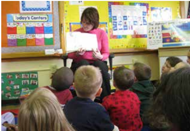
Adopt-A-School Program at Diven Elementary School

Members may join Rotary for many reasons, including community involvement, personal development, professional networking, and camaraderie with fellow members. But perhaps the most important benefit is the satisfaction gained from making a real difference in the world.